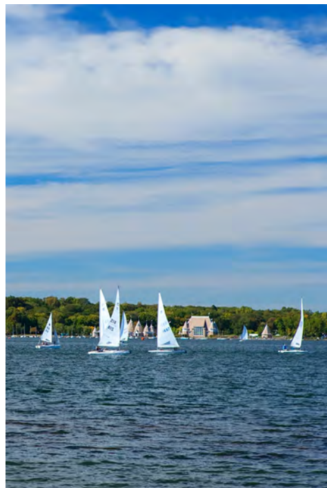
Lake Harriet, Minneapolis

Additional nearby hotels in the Arbor Lakes area of Maple Grove also offer special conference rates. Go to www.iggpartner.org or the Germanic Genealogy Society website www.ggsminn.org for hotel details and how to make reservations. Free shuttle service to and from the conference at the Marriott Northwest will be provided to people staying at the Arbor Lakes hotels who need a ride.