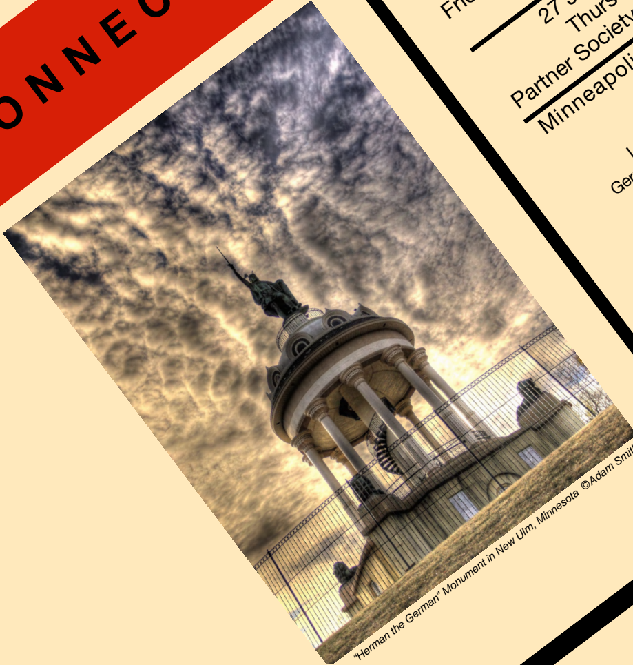
"Herman the German" Monument in New Ulm, Minnesota

www.iggpartner.org Hashtag: #IGGC17 Facebook: IGGPartnership